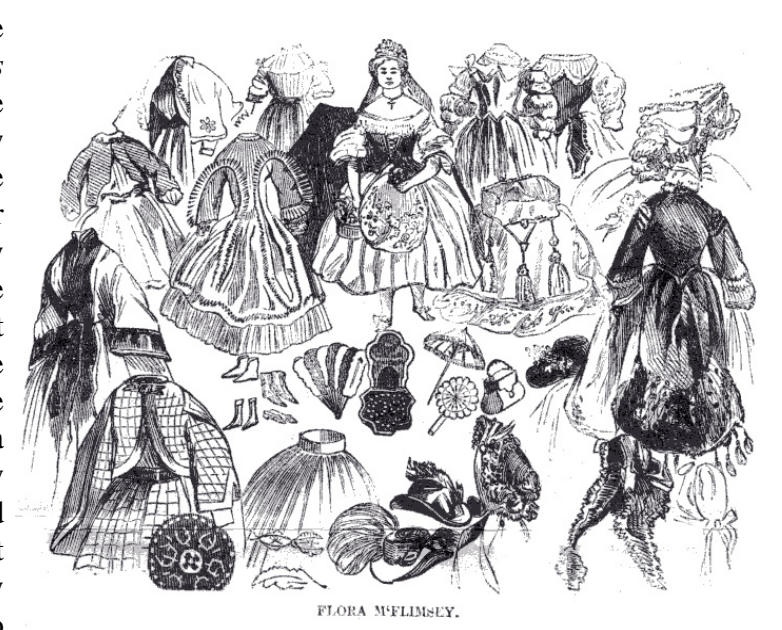
Illustration from Harper's Weekly

Another Flora doll was shown in the April 23, 1864 issue of Harper's Weekly. The article described the accompanying illustration. "The view entitled 'Flora M'Flimsey' on this page represents a Doll contributed to the Fair [New York Metropolitan Fair] by a lady and her daughter, with twelve complete sets of dresses, etc., all of the finest description, and made entirely by the hands of the contributor. The wardrobe thus provided for the miserable Flora includes every garment and accessory the richest taste or heaviest purse could suggest, and yet the whole is offered at a price which would not, probably, pay for the material at the present rates." No additional information could be found about this doll.