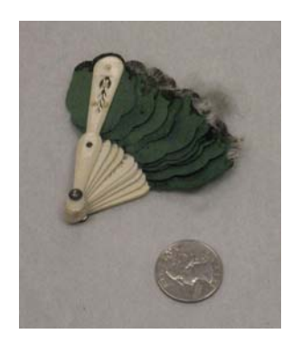
Rose's Fan with a modern quarter for size reference