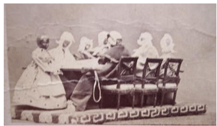
From a CDV of dolls at a quilting party. Image taken to support April 1864 New York Sanitary Commission Fair.

Cleveland, OH, Poughkeepsie, NY, Buffalo, NY, Troy, NY, Louisville, KY, New York, NY, Washington, D.C., Baltimore, MD, St. Louis, MO, Pittsburgh, PA, Philadelphia, PA (2), Dubuque, IA, Springfield, MA, St. Paul, MN, and Milwaukee, WI with multiple fairs being held at some locations as noted. Many smaller fairs, not under the auspices of the Sanitary Commission, were held all over the north. Most of the fund-rasing or benefit dolls were sold or raffled at Sanitary Commission Fairs. Of these fairs, it is probable that all of them had doll sales but the following fairs are associated with surviving dolls — Baltimore, Zanesville, OH [this fair has not been documented], Boston, New