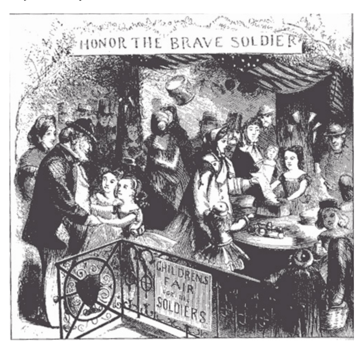
A Chidren's Fair illustrated in The Tribute Book. The engraving includes what appears to be a doll just to the left of the head of the girl on the far side of the table.

An article titled, "What Little Children Can Do for the War," related a story of two small girls, in Philadelphia, who held a "fair" in their bedroom. "The admission fee was three cents. They had little dolls' things of their own manufactures, dressed some china dolls, made pin-cushions, bookmarks, had candy-bags, etc., and with the aid of some cakes and fruit, by way of refreshments, realized the sum of $1.50." The newspaper story went on to relate that the little girls were going to return to their home in Washington and donate the money and other items to soldiers in hospitals. This was just one example of the contributions of a children's fair and most of them sold dolls.