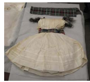
A Shear Dress with Plaid Belt and Accessories