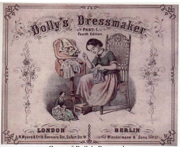
Cover of Dolly's Dressmaker

contained full sized patterns for an eighteeninch doll and provided extensive instructions for constructions the garments and adjusting the patterns to fit individual dolls; the last edition, published in 1896 was written only in English was a combination of doll clothes patterns and paper dolls with costumes. Also, in 1863, the Journal des Demoiselles started publishing La Poupée Modèle or Gazette de la Poupeé which was a monthly publication that included dolls' clothing with patterns. Apparently it was very popular and various editions were published until the end of the nineteenth century. Both Godey's and Peterson's published patterns for doll clothing and knitted items in 1868 and 1874.