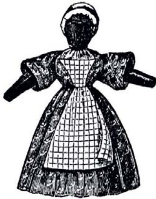
A BLACK DOLL

Directions for this doll was found in The American Girl's Book and it was called a Common Linen Doll. Instructions were given for both a Caucasian and a "Black Doll." It was a simple doll and one that could be easily made, with scraps from the scrap bag, by young girls.